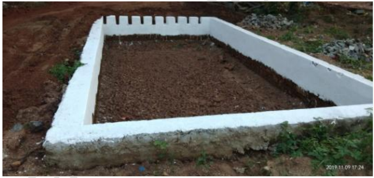
Plate 2: Rain water harvesting in the premises

This refers to the water supply harvested through rain water and other sources. The premises has a pit dedicated to store rain water in 3 nos.