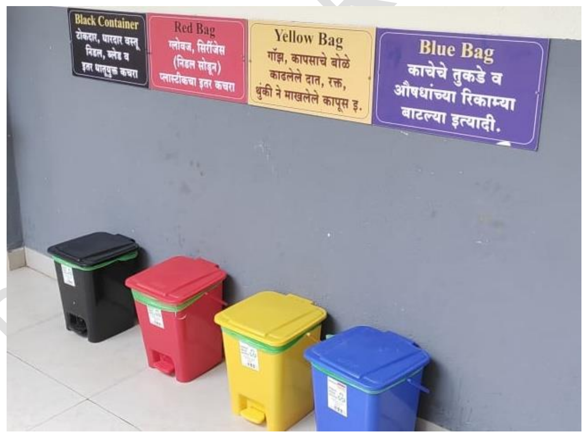
Reference suggestions 2: Twin litter dustbins in the premises

■ Multi-colored waste management bins - There should be more number of dual litter dustbins at various locations in areas such as Canteen, and open spaces. This would inculcate the awareness of waste segregation among students. Whereas a single type of dry waste dustbin should be available inside the teaching areas.