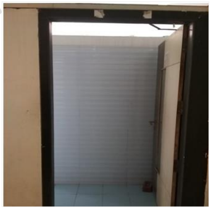
Plate 1: Dustbins and clean washroom in the premises