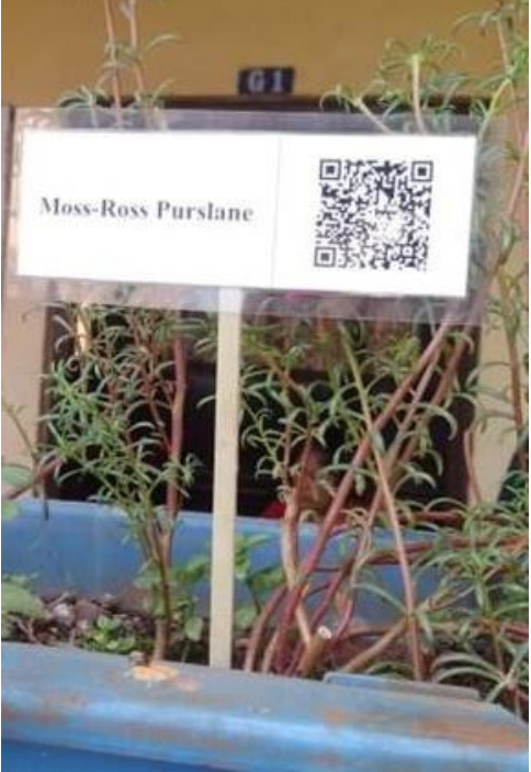
Reference suggestions 1: Signages on the plantations