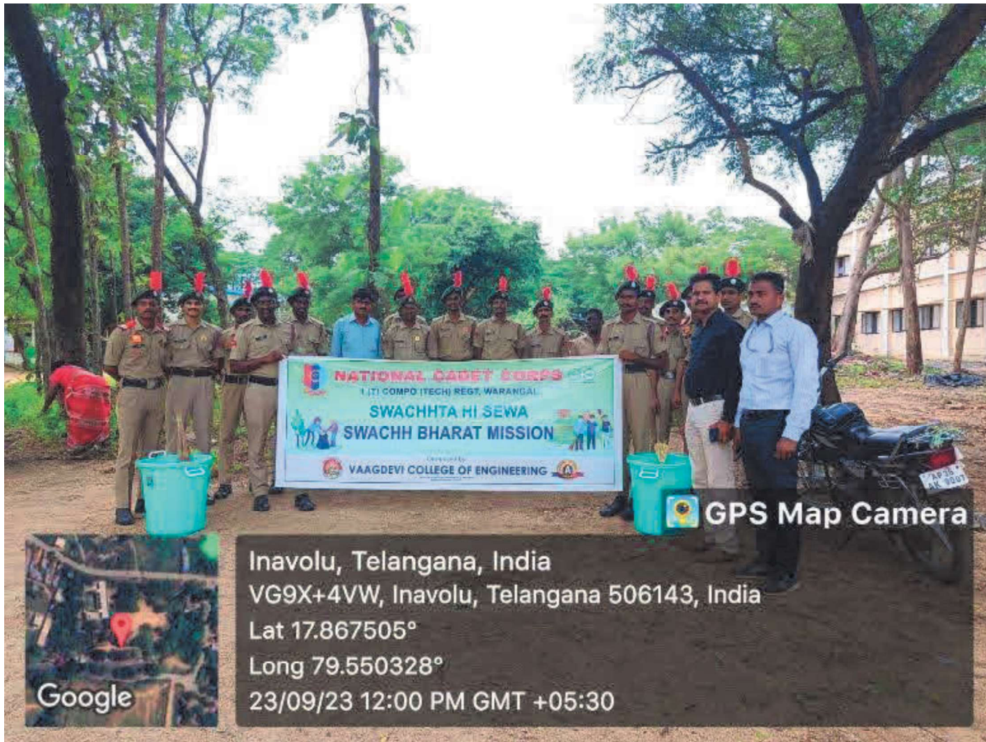
Swatchhi Seva Program(Inavolu)(23/09/2023)