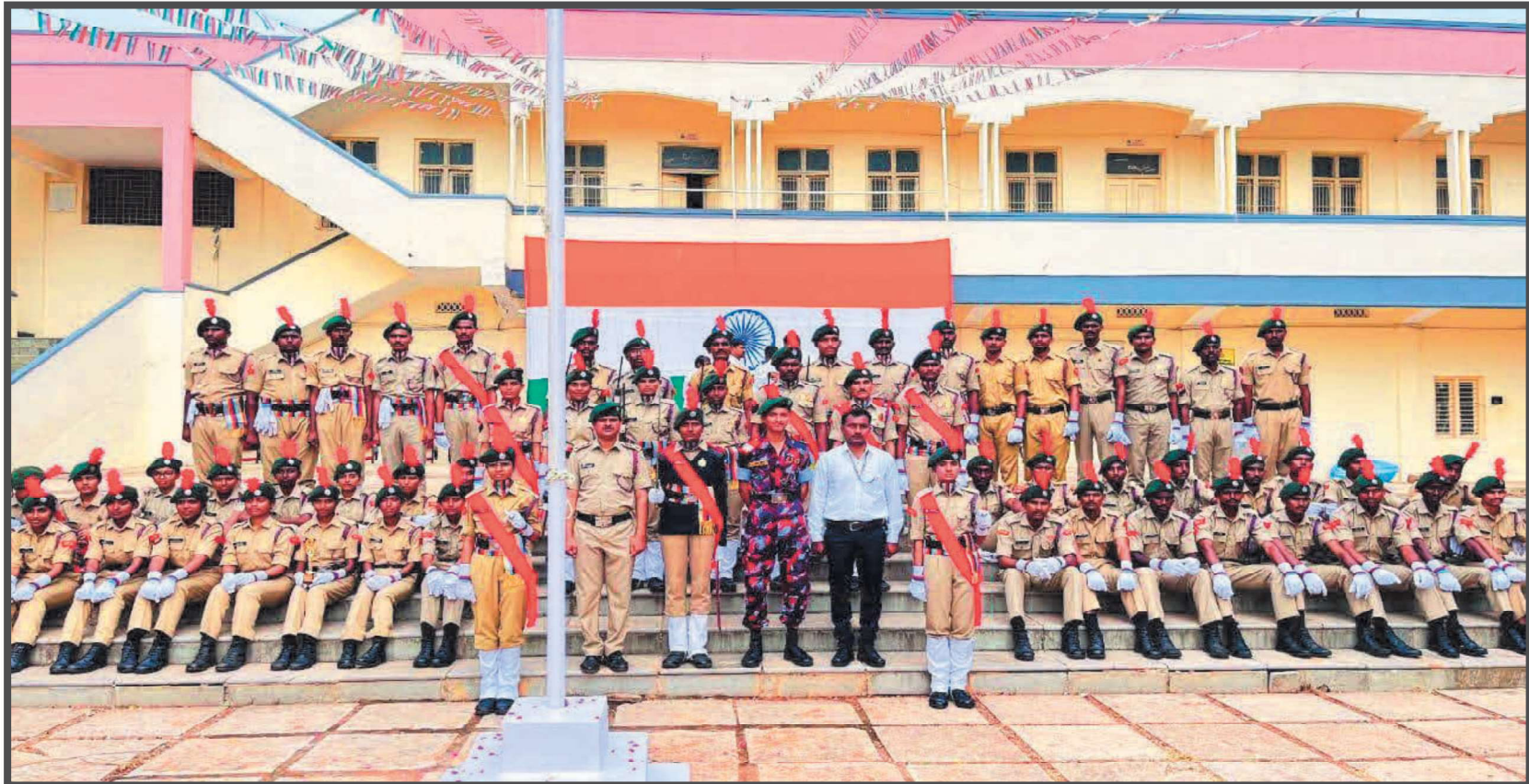
Independence Day(Vaagdevi college's)(15/08/2023)