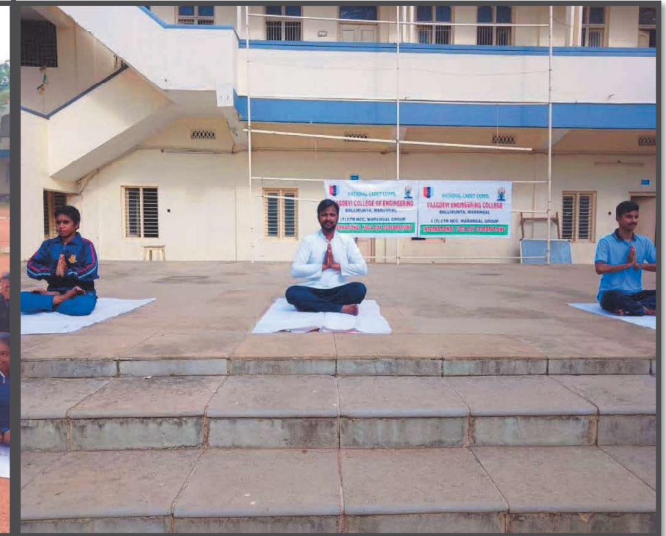
International Yoga Day (21-06-2023)