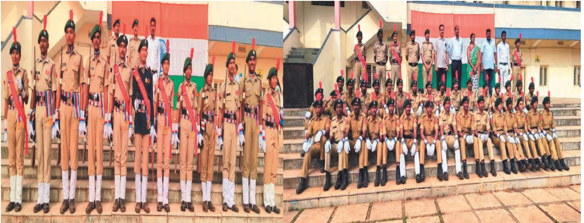
Republic Day 26-01-2024