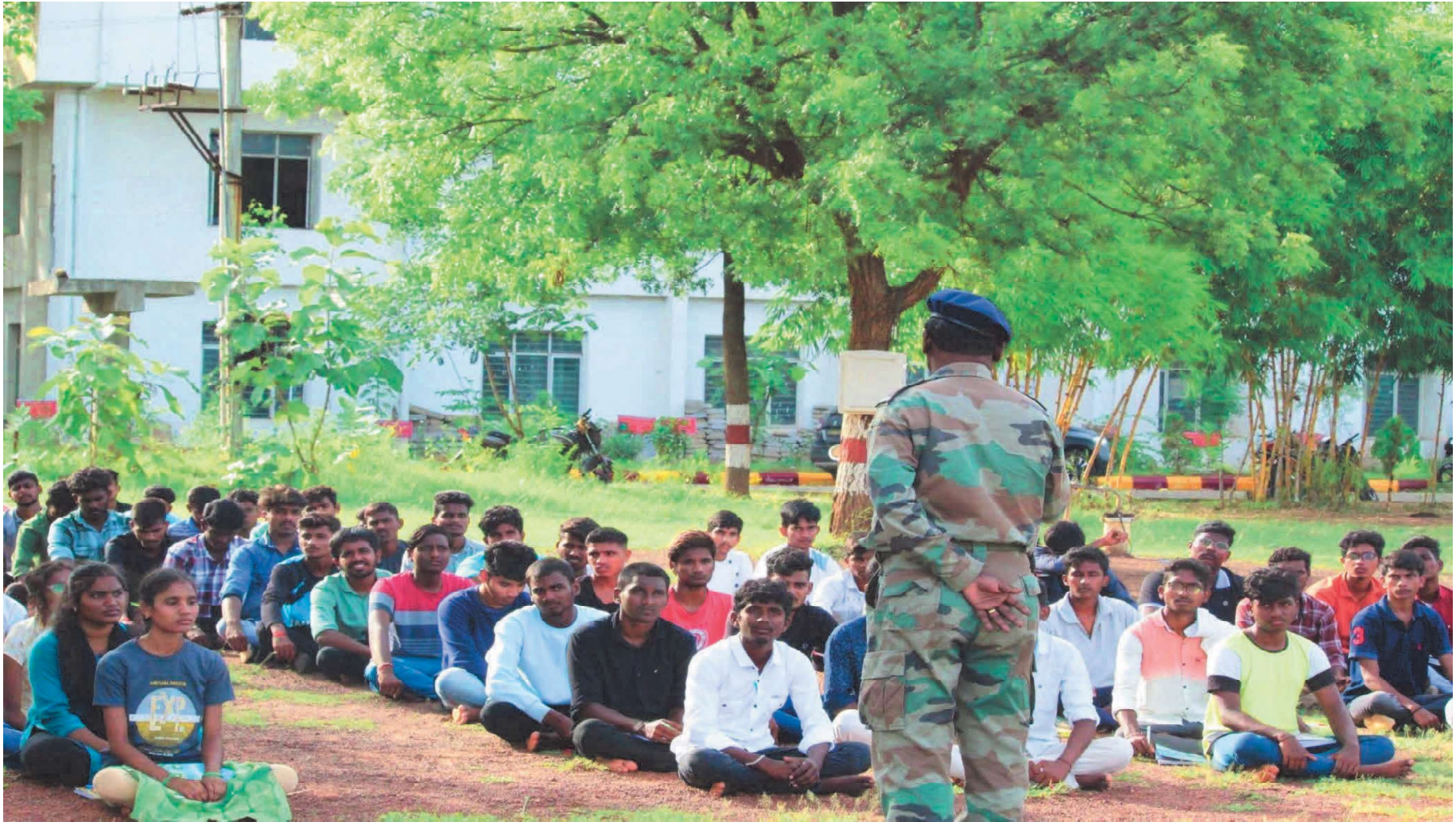
INTERACTION OF AOSIR REGARDING NCC ENROLLMENT & BENEFITS OF JOINING NCC TO WARDS NATIONAL INTIGRATION