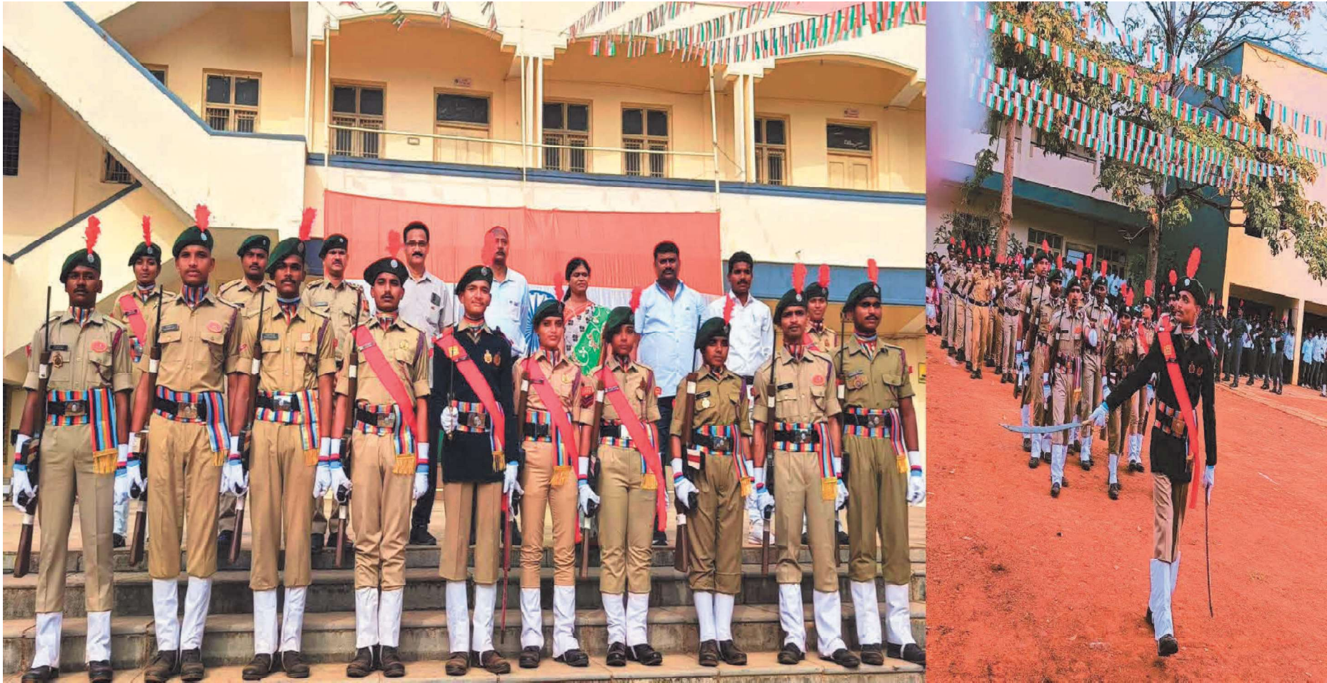
Republic Day 26-01-2024