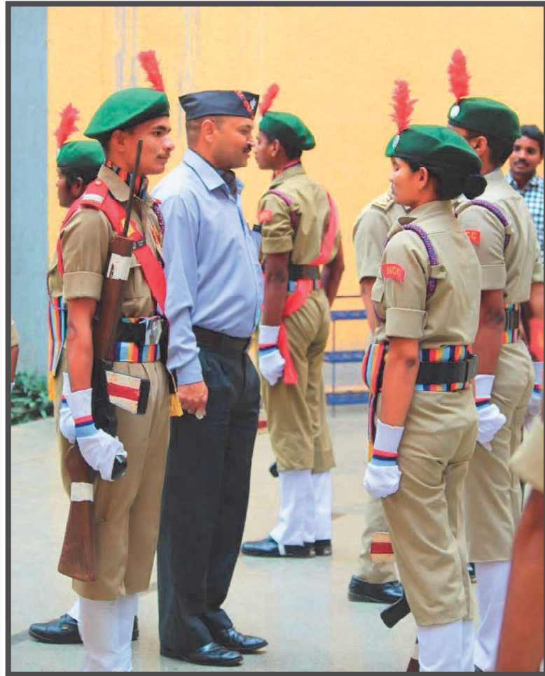
BE-HALF OF NCC Day/Blood Donation(24/11/2023)(CO,1(T)CTR Batalion,Warangal)