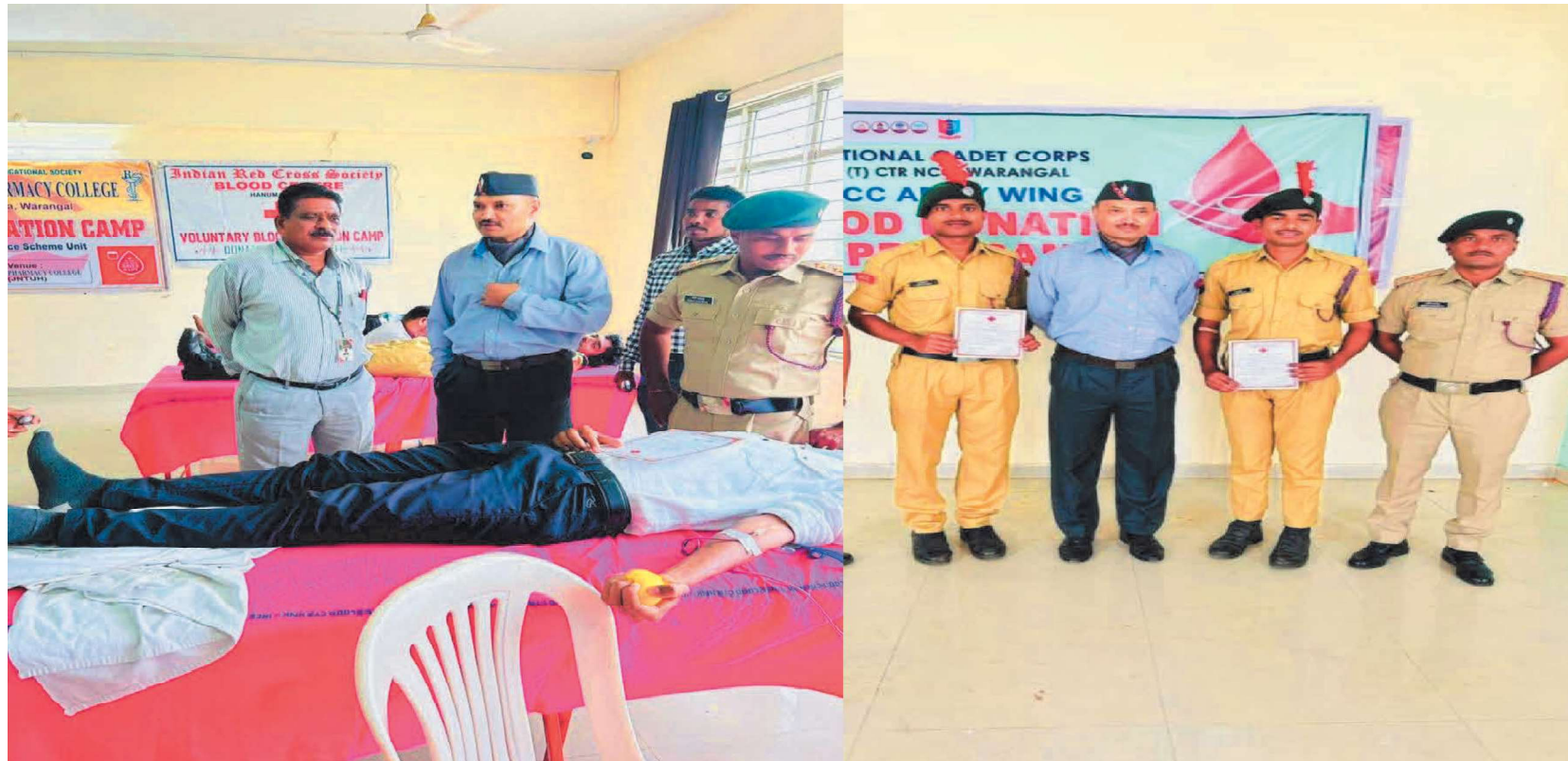
BE-HALF OF NCC Day/Blood Donation(24/11/2023)(COSir1(T)CTR Batalion, Warangal)