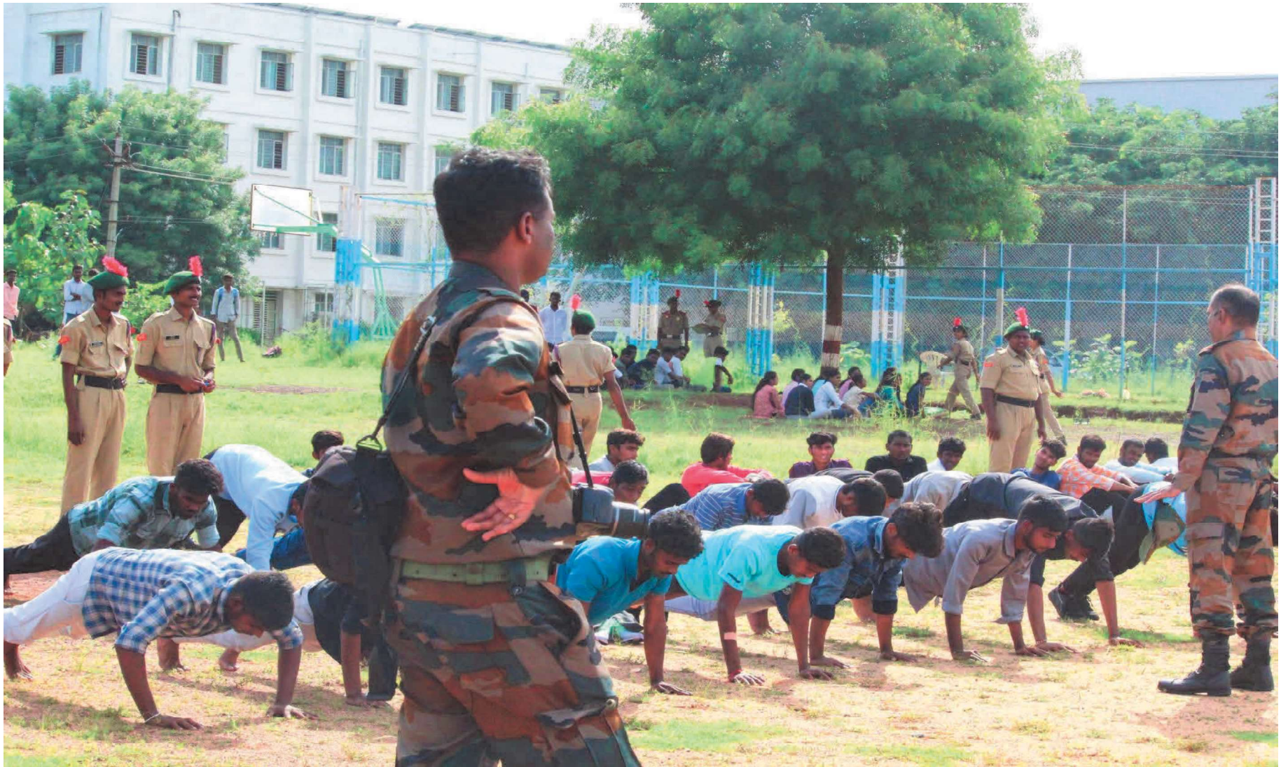
PHYSICAL TEST(RUNNING & PUSH UPS)