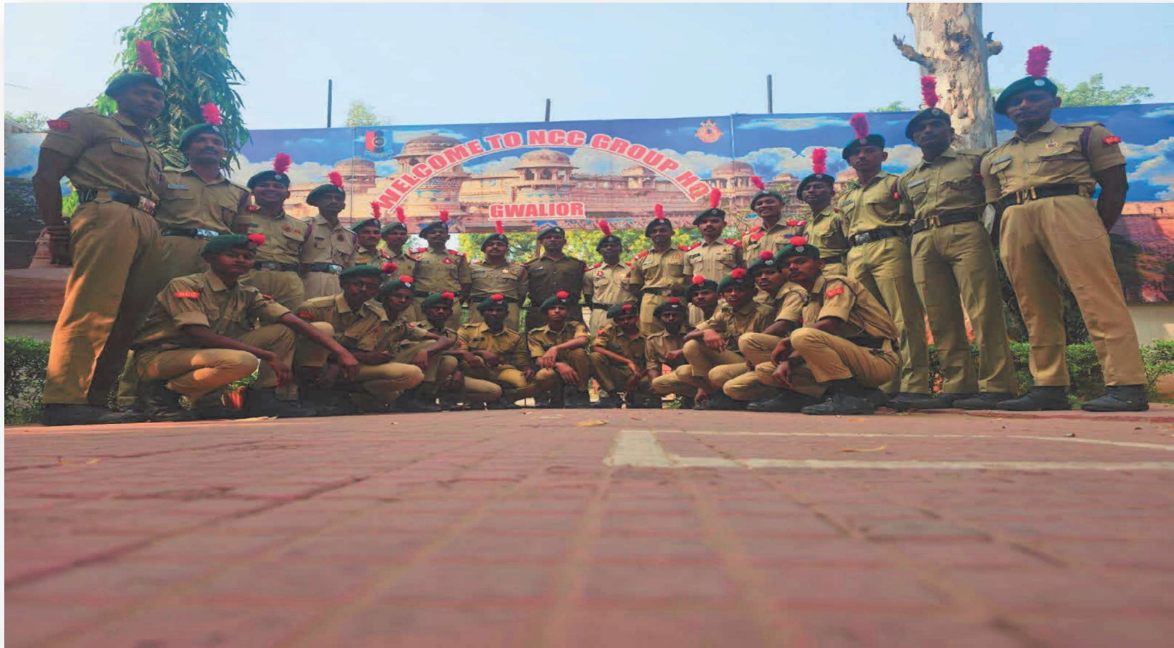
ALL INDIA ROCK CLIMBING & TRAINING CAMP(RCTC)GWALIOR(15-11-2023/26-11-2023)