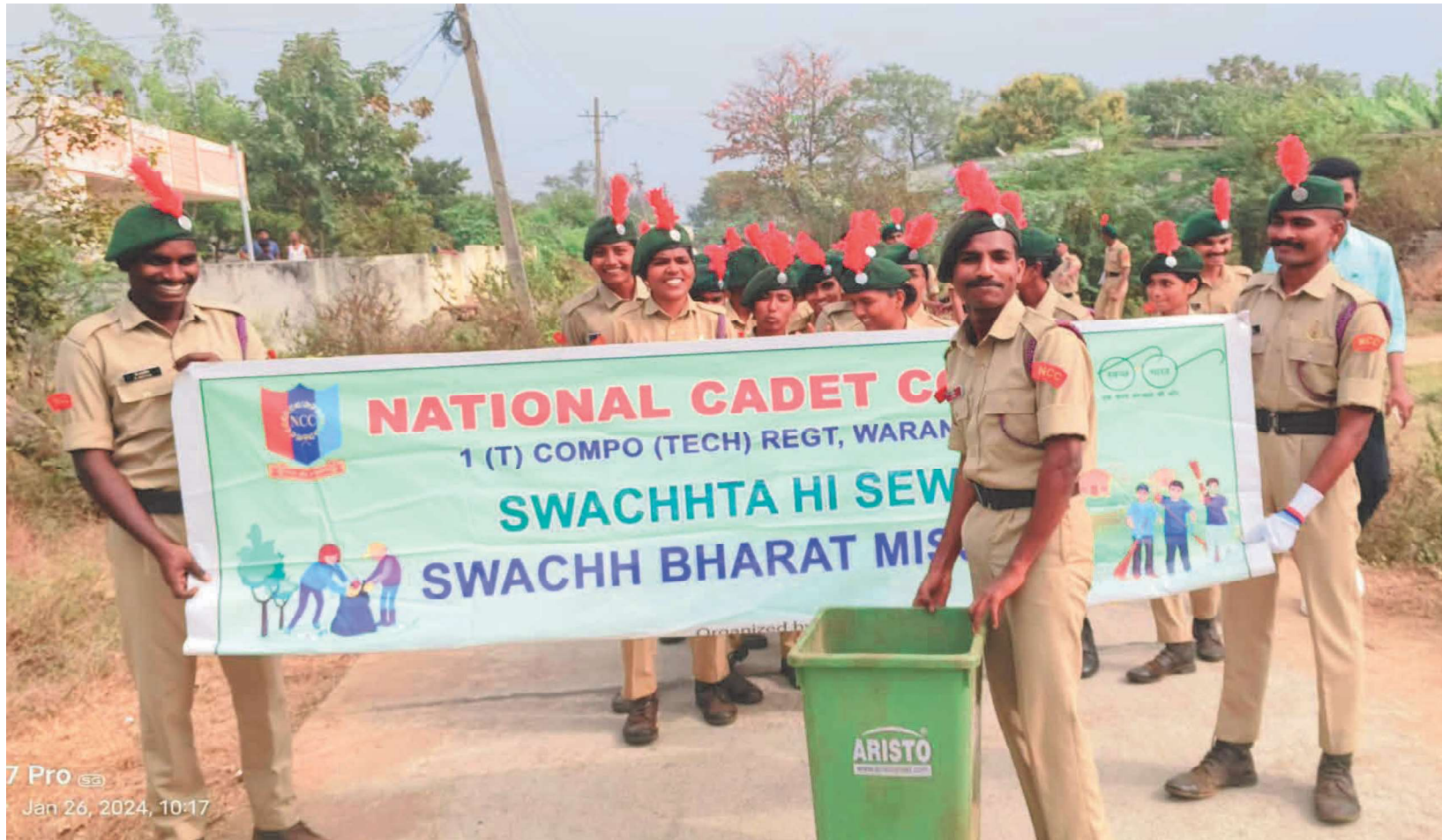
Swachh Bharath Abhyan(Swachh Hi Sewa) (26-01-2024)