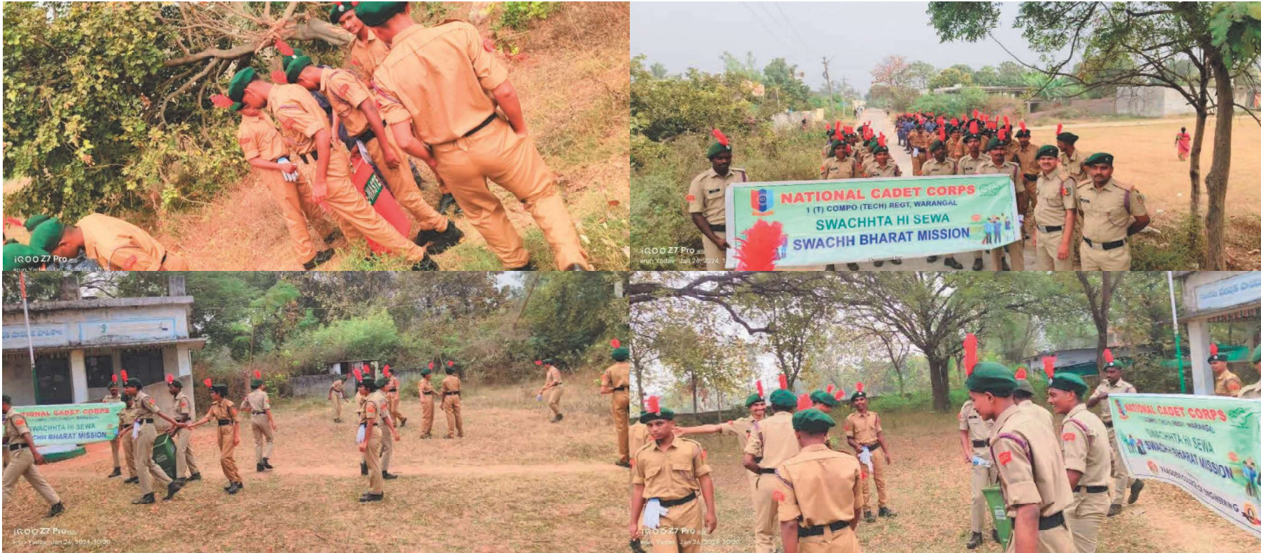
Swachh Bharath Abhyan(Swachh Hi Seva)(26-01-2024)