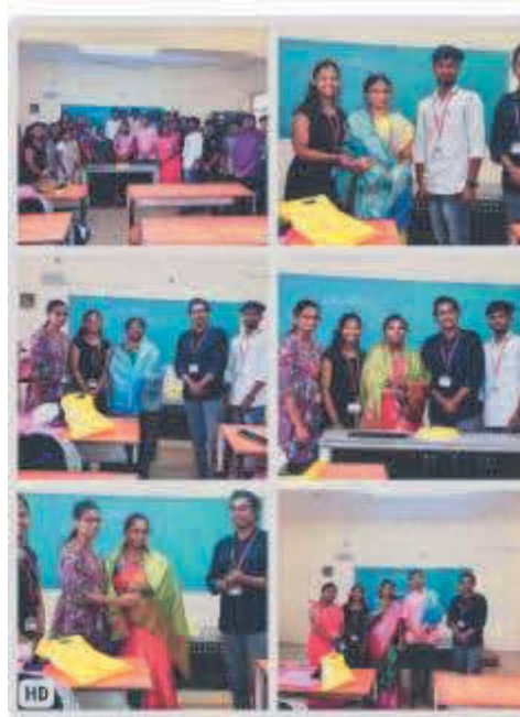
CSE # ENGINEER'S DAY celebrations

Highlights the importance of engineers in solving global challenges like climate change, infrastructure development, and digital innovation .Encourages young minds to pursue careers in engineering and technology .Recognizes the hard work and dedication of engineers in building better societies .Whether through ground breaking structures, innovative technologies, or sustainable solutions, engineers continue to be a driving force in progress. Engineers' Day is a tribute to their indispensable contributions!