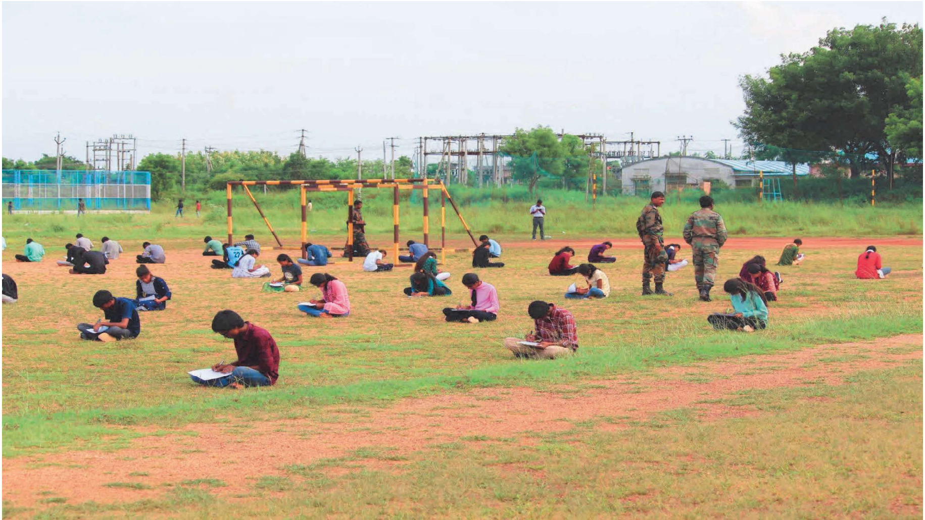
WRITEN TEST FOR STUDENT'S